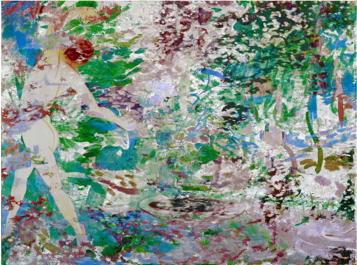
Henri's Well, 2018