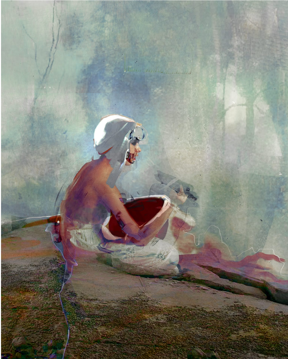
Blood Bowl, 2017 detail