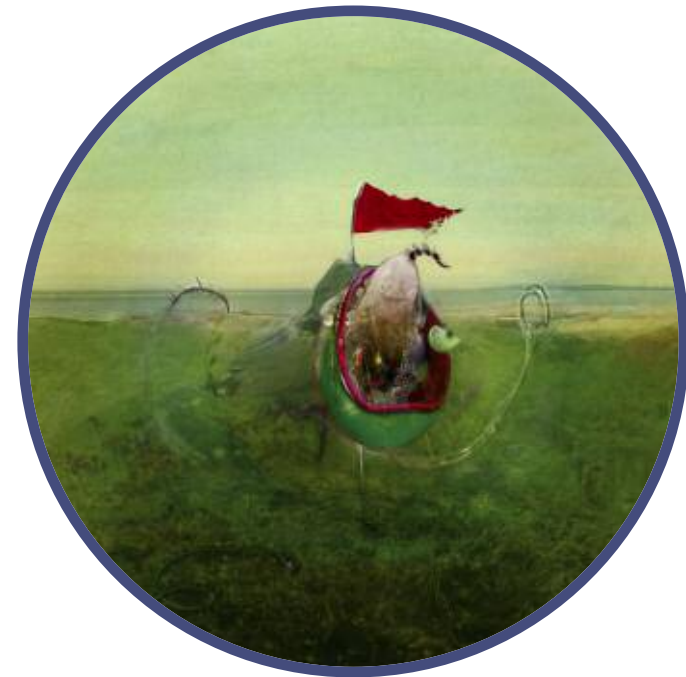
© Bluenose, 2011 ▲ The Infant and The Garden Hose , 2011 ▼