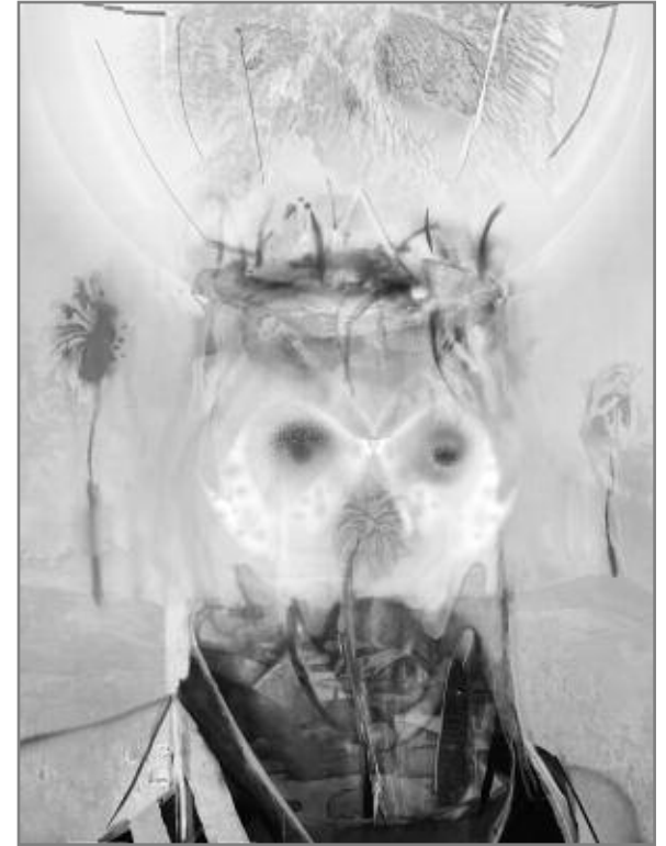
① Paradise, 2011 ▲

Artists are granted the luxury of being everyday philosophers without having to exist in academia or other bureaucracies. It is a personal responsibility to visualize our zeitgeist because artists have the time to contemplate the world and reflect upon the relationships that exist between people and things. It is a very exciting time in art — I don’t have to uphold Modernist ideals, but can put into my work whatever I deem important.